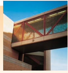
PERRY HIGH SCHOOL • PITTSBURGH, PA

by an architect's imagination and vision.